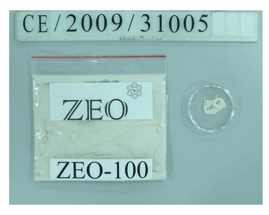
** 報告結尾(End of Report) **

Unless otherwise stated the results shown in this test report refer only to the sample(s) tested. This test report cannot be reproduced, except in full, without prior written permission of the Company. 除非另有說明,此報告結果僅對測試之樣品負責。本報告未經本公司書面許可,不可部分複製。