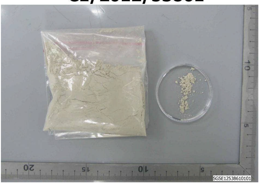
** 報告結尾 (End of Report) **

Unless otherwise stated the results shown in this test report refer only to the sample(s) tested. This test report cannot be reproduced, except in full, without prior written permission of the Company.除非另有說明,此報告結果僅對測試之樣品負責。本報告未經本公司書面許可,不可部分複製。 This document is issued by the Company subject to its General Conditions of Service printed overleaf, available on request or accessible at www.sgs.com/terms_and_conditions.htm and, for electronic format documents, subject to Terms and Conditions for Electronic Documents at www.sgs.com/en/Terms-and-Conditions/Terms-e-Document. Attention is drawn to the limitation of liability, indemnification and jurisdiction issues defined therein. Any holder of this document is advised that information contained hereon reflects the Company's findings at the time of its intervention only and within the limits of Client's instructions, if any. The Company's sole responsibility is to its Client and this document does not exonerate parties to a transaction from exercising all their rights and obligations under the transaction documents. This document cannot be reproduced except in full, without prior written approval of the Company. Any unauthorized alteration, forgery or falsification of the content or appearance of this document is unlawful and offenders may be prosecuted to the fullest extent of the law.